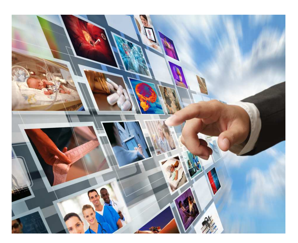
PatientLogix<sup>™</sup> Media Studio Delivers Highly Accessible Cloud Based Health Educational Media Library

Highly Accessible Cloud Based Health Education Media Library The PatientLogix<sup>™</sup> Health Education Media Library provides timely, efficient and effective enterprise media library management services, complete with easy-to-use media library tools and management functionality via its PatientLogix<sup>™</sup> Authoring Tool. These transformative media library services remove information and media access barriers at the enterprise level and seamlessly make health education media access effortless for any healthcare organization. The end result is a process of open authenticated access throughout the healthcare facility or organization to informational and media resources to support the organization's patient health education programs and enhancing its ability to deliver health education media content to its patients in a modern workforce environment throughout its patients end points: hospitals, clinics, physicians' offices and the patients' home.